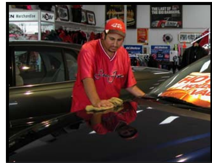
Chamoising a New Holden