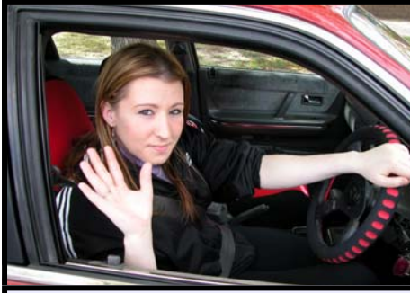
"Keep Focusing on your Goal"